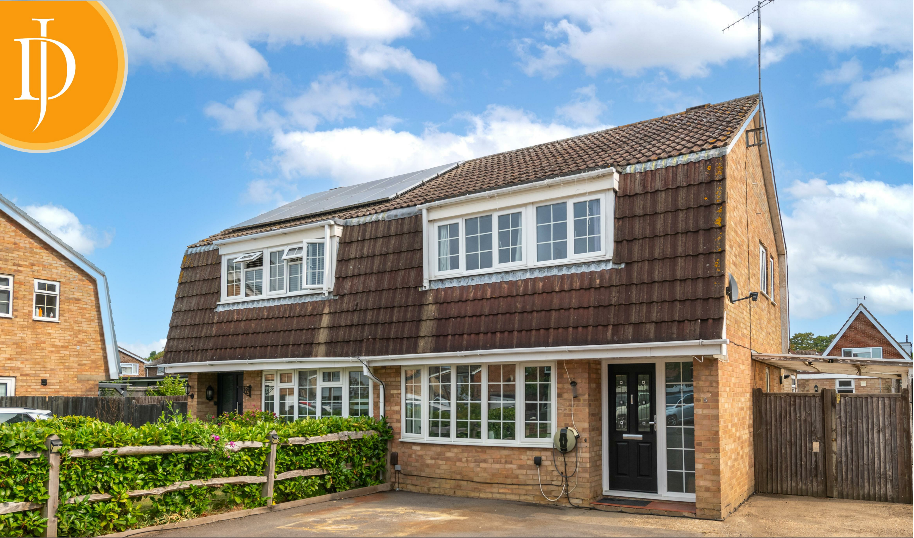
6 Chesters, Horley, RH6 8BP Asking Price £525,000